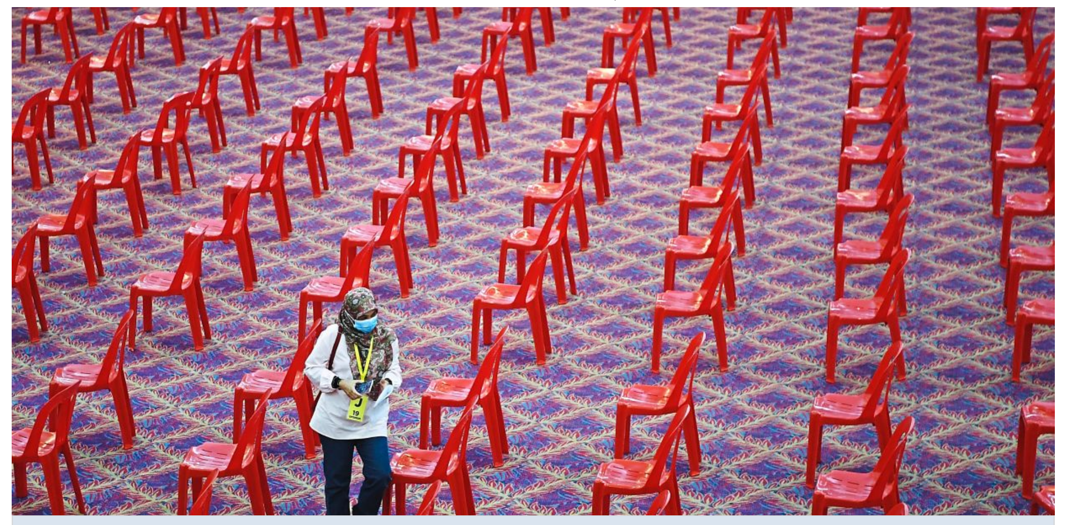
Front of the line: A vaccine recipient entering the hall for inoculation on the opening day of the PPV at Dewan Jubli Perak Sultan Haji Ahmad Shah.

PETALING JAYA: Relaxation of Covid-19 rules can be considered for those vaccinated as it may encourage hesitant individuals to get their Covid-19 jab, say health experts.